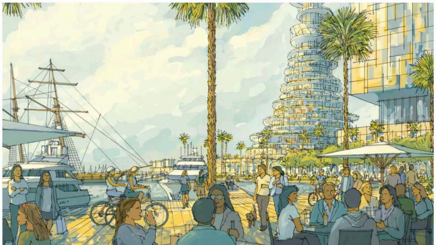
Ground-level view of the proposed observation tower.

The proposal, which will have to undergo extensive environmental review and be approved by the California Coastal Commission, is not without controversy, however.